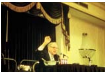
PICTURED ABOVE: WARREN BUFFETT, THE SECOND RICHEST MAN IN THE WORLD